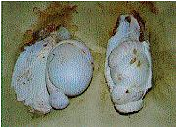
1 ( ) ( )